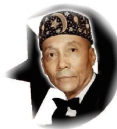
The Honorable Elijah Muhammad Messenger Of Allah

The Honorable Elijah Muhammad advises us that we can never live as we desire—having freedom, justice and equality – until we are in our own